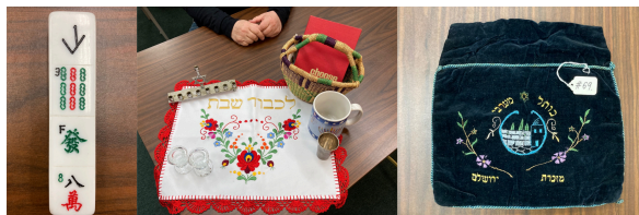
JHSGNH Judaica Project