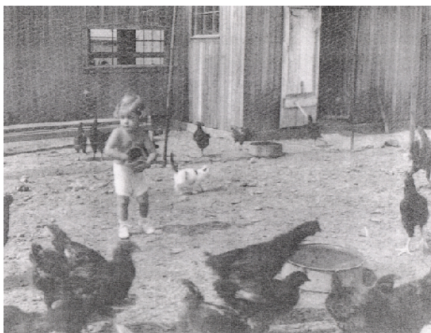
Photo of a little girl feeding chickens in New Haven 1932